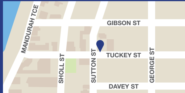
Mandurah: 22 Tuckey Street, Tel: (08) 9581 4010